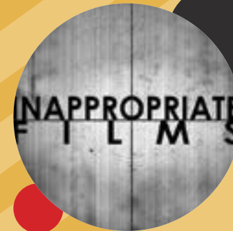
INAPPROPRIATE FILMS PRODUCTION COMPANY

NOLAHFF was a brilliant festival. We travelled from the UK and was worth the trip. Great films at a great venue was enough but the organisers were the cherry on the cake. From a filmmaker lunch to excellent panels and parties it was top notch all the way.